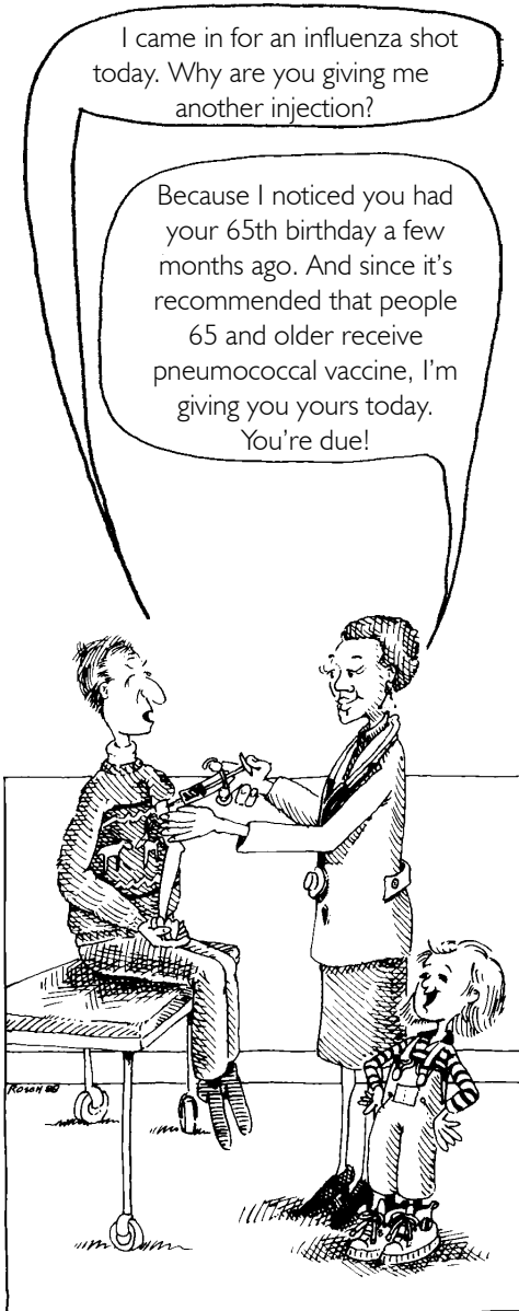
Artwork courtesy of New York State Department of Health

Highlighting the latest developments in routine adult immunization and chronic hepatitis B virus infection.