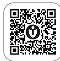
MMRV Vaccine (Measles, Mumps, Rubella, and Varicella)