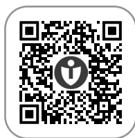
DTaP (Diphtheria, Tetanus, Pertussis) Vaccine [ped]