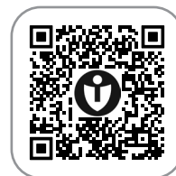
Respiratory Syncytial Virus (RSV) Preventive Antibody [infant/child]