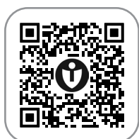
Td (Tetanus, Diphtheria) Vaccine