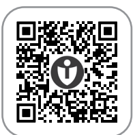
Haemophilus influenzae type b (Hib) Vaccine