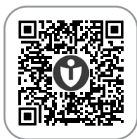
COVID-19 Vaccine [mRNA]

Scan the QR code for the current VIS (PDF format):