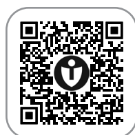
Varicella (Chickenpox) Vaccine