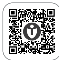
Hepatitis A Vaccine