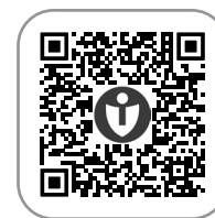
Hepatitis B Vaccine