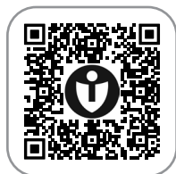
Multi Pediatric Vaccines [DTaP, Hib, Hepatitis B, PCV, Polio]