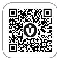
MMR Vaccine (Measles, Mumps, and Rubella)