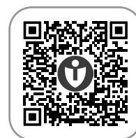
Influenza (Flu) Vaccine (Live, Intranasal)