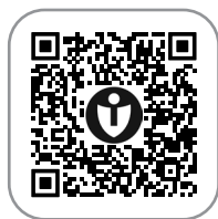
Meningococcal B Vaccine